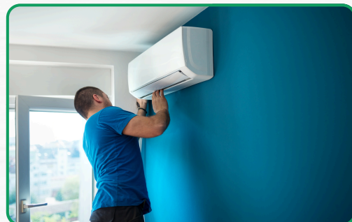
AC REPAIR WORKS