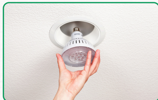
INSTALLING LIGHTS AND FIXTURES